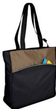
Zipper Top Totebag