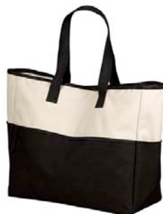
Open Top Totebag

Tote bags in solid black only. Colors shown for ease of seeing details